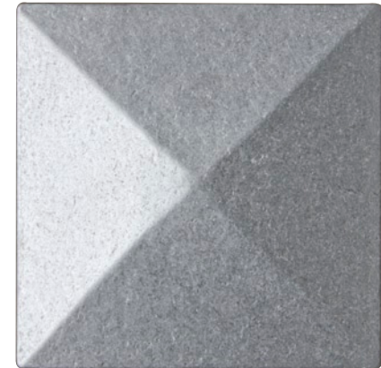
Pyramid Tile available in 4-3/8"

Eleek also offers extruded aluminum tiles in specifiable sizes and in quantity. These are similar to our cast tiles but with sharper edges and no corrugated backing. Call to inquire.